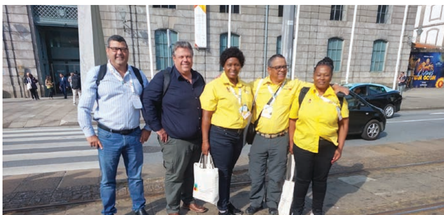
The WoF-Kishugu JV attended the Eighth International Wildfire Conference (IWFC) in Porto, Portugal